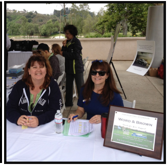
Page 9 - May 2013